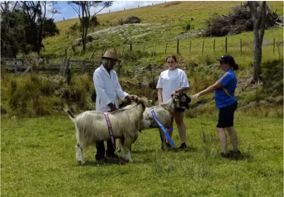
Judging senior bucks at Northland Club Show 2024