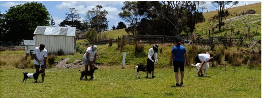
Sonia Gibbins judging AR Juniors at Northland Club Show 2024