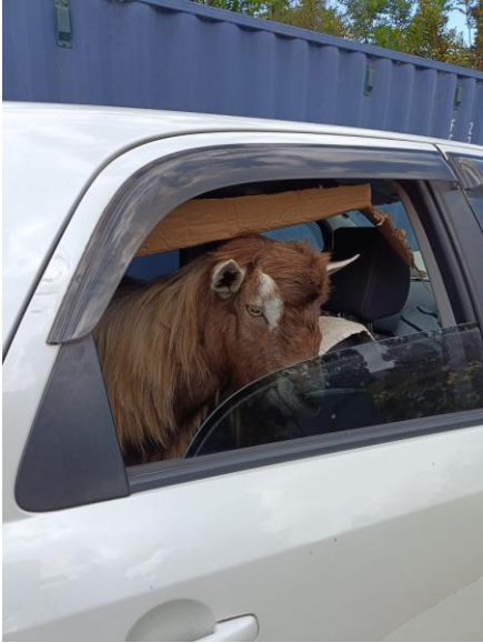
Broomehill Buckling on way to a show.